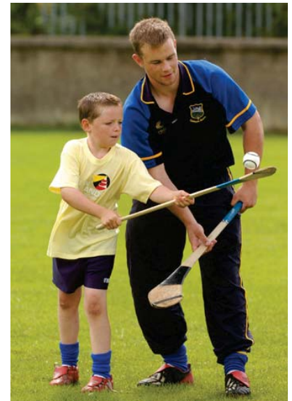
DOCKLANDS FESTIVAL OF HURLING