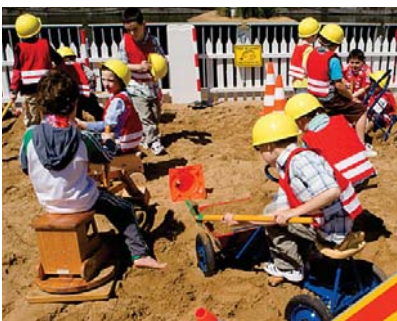
DOCKLANDS URBAN BEACH

The importance of internet facilities in education, training and the community generally has been emphasised by the community. The availability of such digital media is considered integral to the growth of both living and working communities and should be encouraged wherever possible.