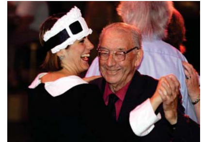
AFTERNOON TEA DANCES, DUBLIN FRINGE FESTIVAL

It is an objective of the Master Plan 2008 to promote sustainable employment throughout the Docklands. Training and administrative support have been identified as key requirements. The