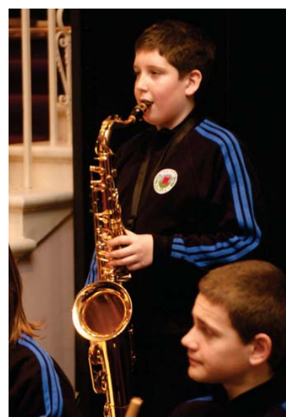
DOCKLANDS MUSIC IN SCHOOLS