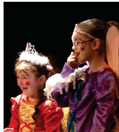
DOCKLANDS SCHOOLS DRAMA PROGRAMME

Work with local schools and communities to increase school retention rates.