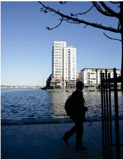
GRAND CANAL DOCK

Access to public waterways and full utilisation of water bodies including the canals and Grand Canal Dock Basin, as well as public access to green spaces has been called for by local residents and is to be further explored. Recreation and amenity use of the Docklands waterways must match the terrestrial equivalent. And, on land, hitherto unexplored possibilities are coming into focus. For example, developed on the site of waste ground on Church Road, Sean O' Casey Park has become an appealing and attractive amenity for the East Wall area and its residents. It shows that the brown field sites in the Docklands have excellent potential for local amenity and recreational use, notwithstanding years of neglect and existing poor conditions.