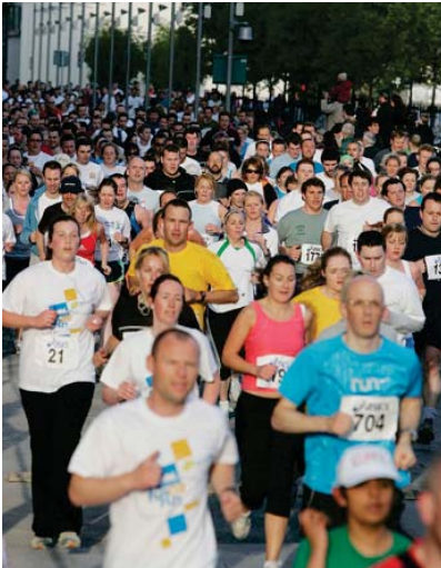
DOCKLANDS FUN RUN