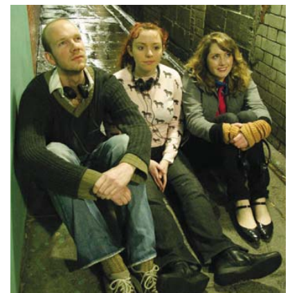
'AUDIO DETOUR', PART OF 'WE ARE HERE 2.0', 2007