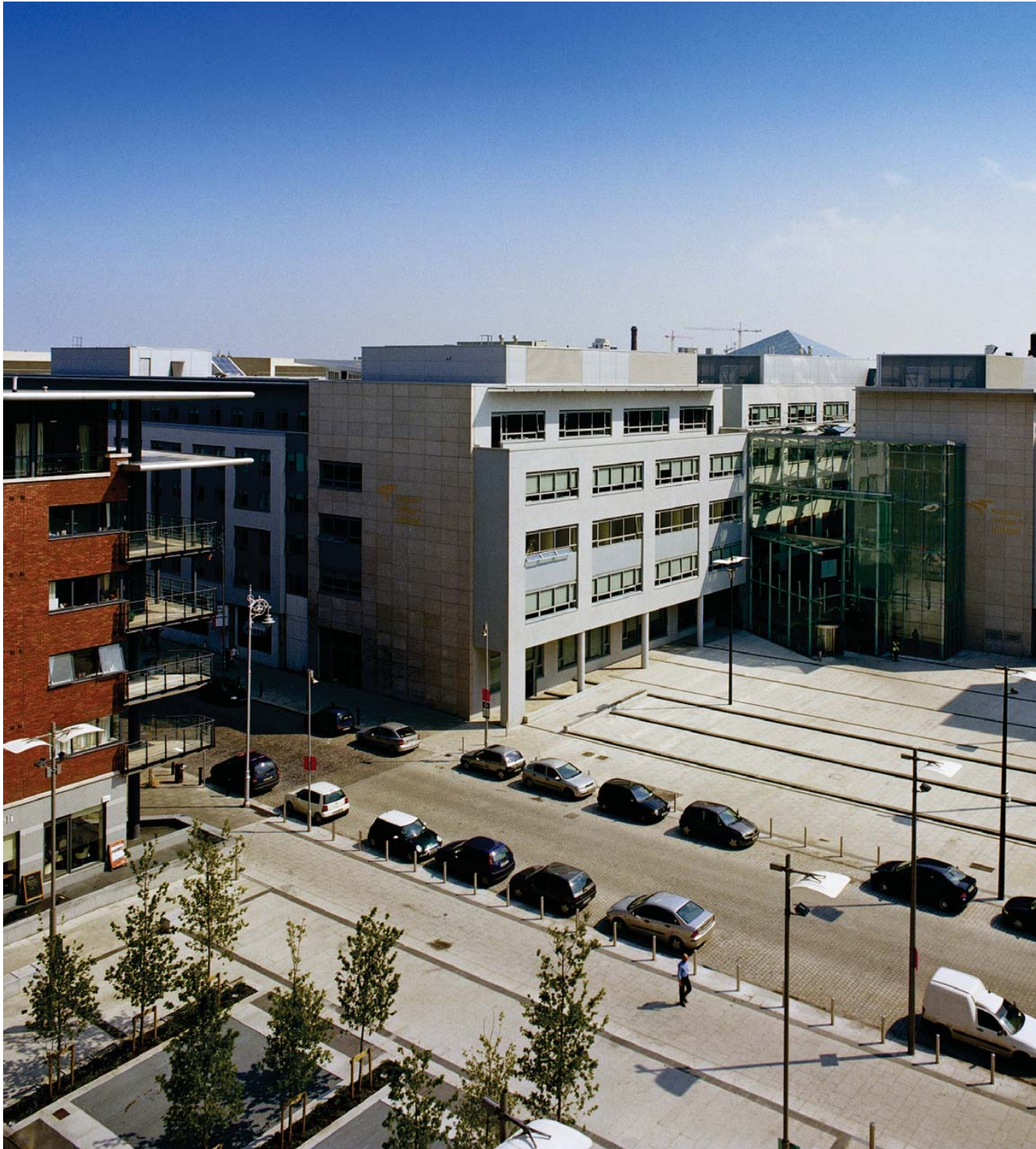
NATIONAL COLLEGE OF IRELAND